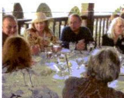
Lunch at Tangata Restaurant

at the Huntington, held on Sunday, May 31, 2009. Following a lively question and answer period, members and their guests were then free to spend the afternoon visiting the gardens and galleries at the Huntington Library including the newly re-opened Virginia Steele Scott Galleries of American Art Wing.